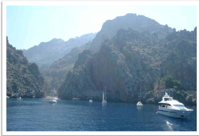
Sa Colobra Bay

In the afternoon we will continue up the North West coast exploring Cala Tuent and Sa Colobra stopping for a swim or a stroll ashore (sea conditions permitting) before rounding the headland at Formentor and entering the Bay of Pollensa.